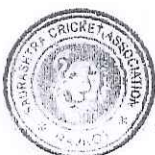
Illustration 4: E is the President of SCA and his company F owns 12 cricket clubs in the State from

Illustration 3: C is an umpire. His daughter D is a member of a team which is playing a match in which C officiates. C is hit by Conflict of Interest.